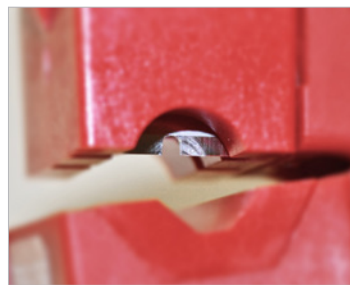
High quality steel blade cassettes remain sharp after 3,500 uses.