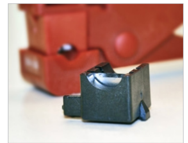
Quickly identify different tools by body & blade cassette color.