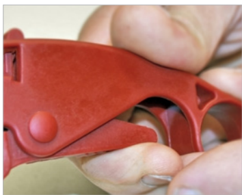
Ergonomic tool body is designed for comfort & easy operation.