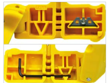
Spare blades and an installation tool stored conveniently within the tool.

For more information or to locate the nearest authorized Ripley® distributor, please visit www.ripley-tools.com or call 1 (800) 528-8665 to speak to a customer service representative.