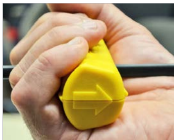
Close the tool onto the cable and pull in the direction of the arrow; clamps tightly — no latch required.