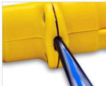
Precision blades easily cut through jacket without damaging fiber.