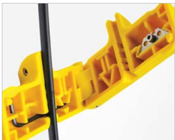
Hinged design opens to accept cable for end and mid-span applications without disassembling tool.