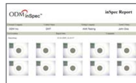
Create closeout reports & share files via WiFi. Reports are condensed to maximize space & simplify sharing.