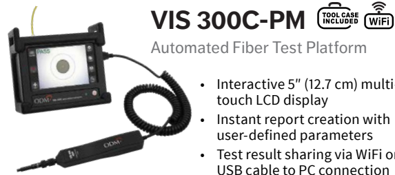
VIS 300C-PM Automated Fiber Test Platform