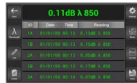
Optional on-board OPM & VFL provide added capabilities for technicians seeking an all-in-one testing solution.