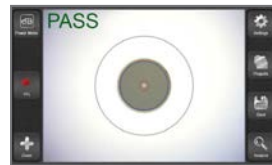
Obtain color-coded PASS/FAIL results & easily configure IEC profiles for inspecting many different fiber types.