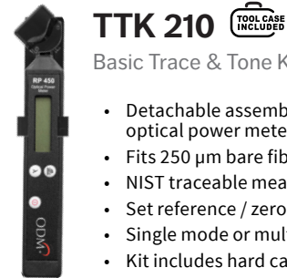
TTK 210 Basic Trace & Tone Kit