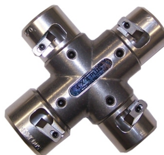
4 X 4