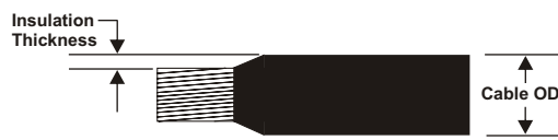
CHAMFER CUT: CB 108 BLADE

WARRANTY: RIPLEY warrants its products against defective materials and workmanship for a period of one year from date of shipment from the RIPLEY factory provided the product is utilized in accordance with instructions and specified ratings.