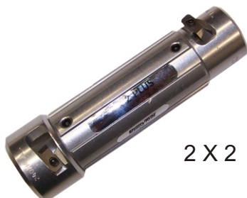
2 X 2

Note: This tool is designed to strip 45 Mil to 110 Mil XLPE and EPR insulations. Insure that the proper cutting head (bushing) has been selected for the wire you are using. Both tools use the same bushings.