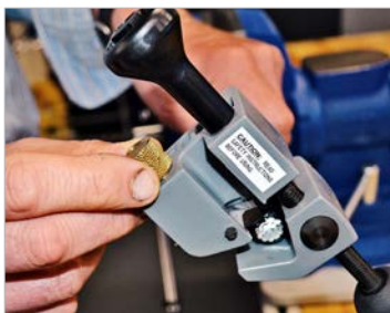
Adjustable to suit #8 to 1000 kcmil secondary cables with various insulation thicknesses.