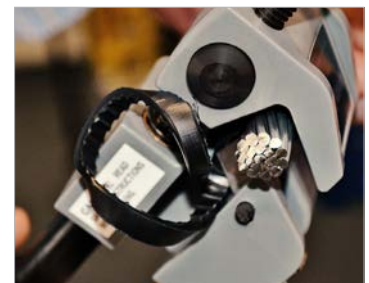
Unique, low-friction V-jaw provides precise & accurate clamping.