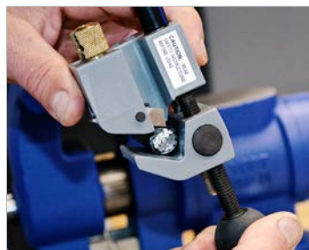
Recessed steel blade assures safety & is easily replaced.