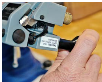
Ergonomic comfort grip & rotating handle increases leverage.