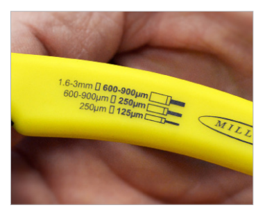
Convenient stripping guide printed on the tool handle.