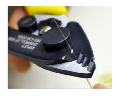
Precision made to prevent nicking or scratching the fiber.