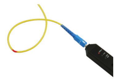
Red light from the VF 610 is visible at bends or breaks in up to 3mm jacketed single-mode fiber.