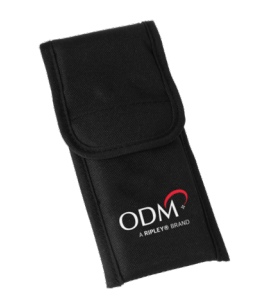
Single-instrument padded carrying pouch included.