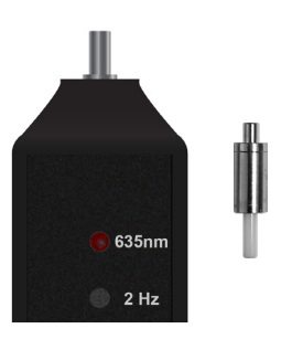
Unit comes with a 2.5mm universal input adapter. A 1.25mm converter adapter is available. See ordering information on the next page.