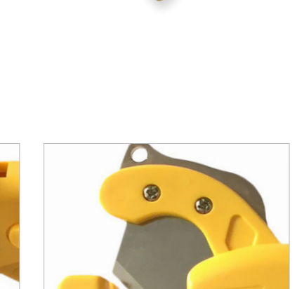
Fixed stainless steel blade requires no adjustments and replace easily.