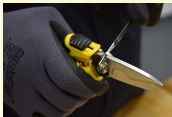
Round cutting notch for small-gauge copper or aluminum