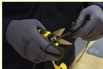
Cuts up to 4 AWG copper or aluminum wire in metal cutting blade