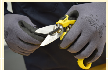
Ergonomic grip and rounded edges for repeatable cuts with no pinch points

For more information or to locate your nearest authorized Ripley® distributor, visit www.ripley-tools.com or call 1 (800) 528-8665 to speak with a customer service representative.